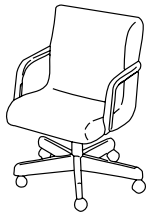
1007 Management Swivel, Wood Arms/Base (shown) 1077 Management Swivel, Black Arms/Base