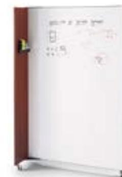
Mobile Teaming Board